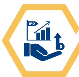
Fund Raising & IPO Listing